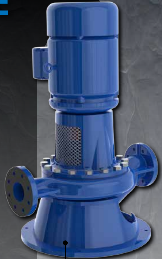
VLS PUMP [Shown with optional CI stand]

For consulting engineers, visit GrundfosExpress.com for technical information. For Grundfos sales and distributors, visit GrundfosExpressSuite.com